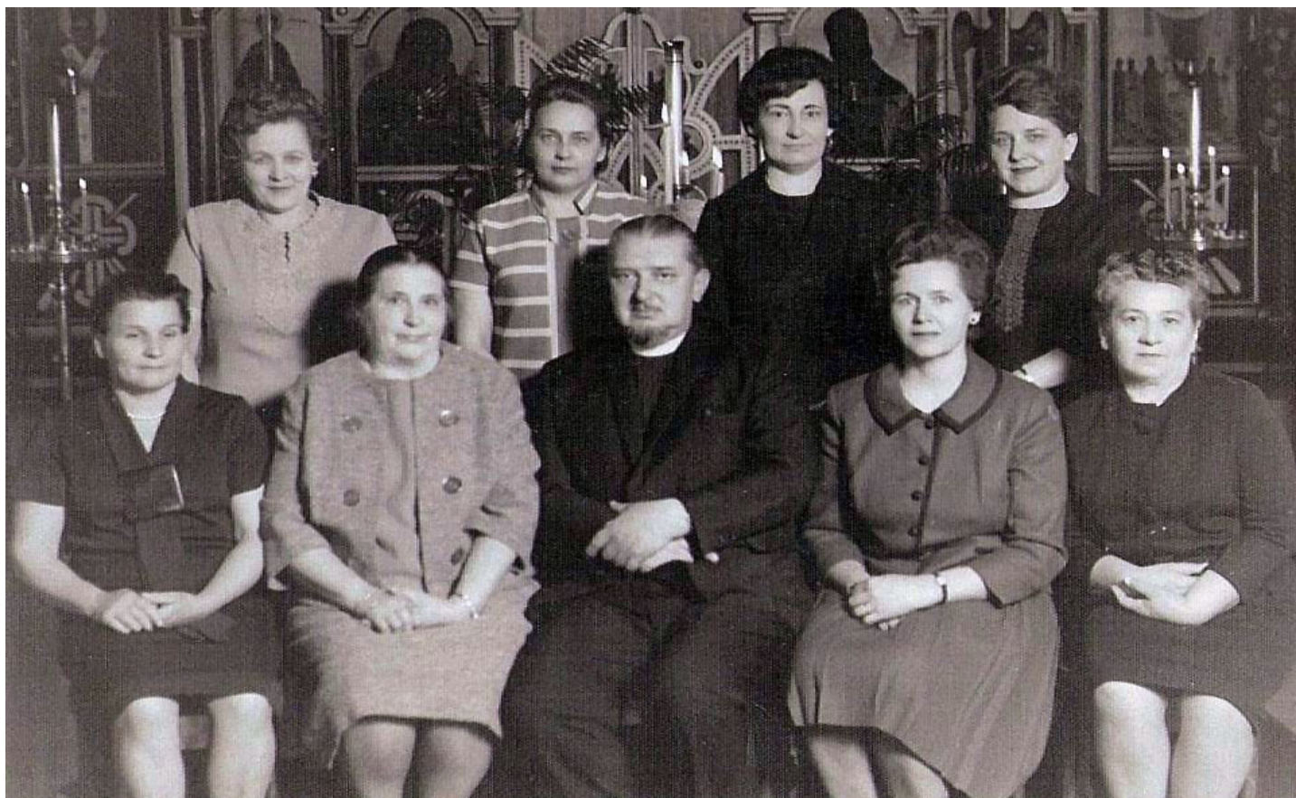
Rochester, New York, 1967

Saturday, March 14, 2015 - Memorial Divine Liturgy and Interment - 10am - St. Andrew Memorial Church and Cemetery, South Bound Brook, NJ